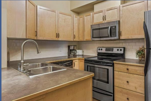
Lots Of Cabinet & Counter Spaces