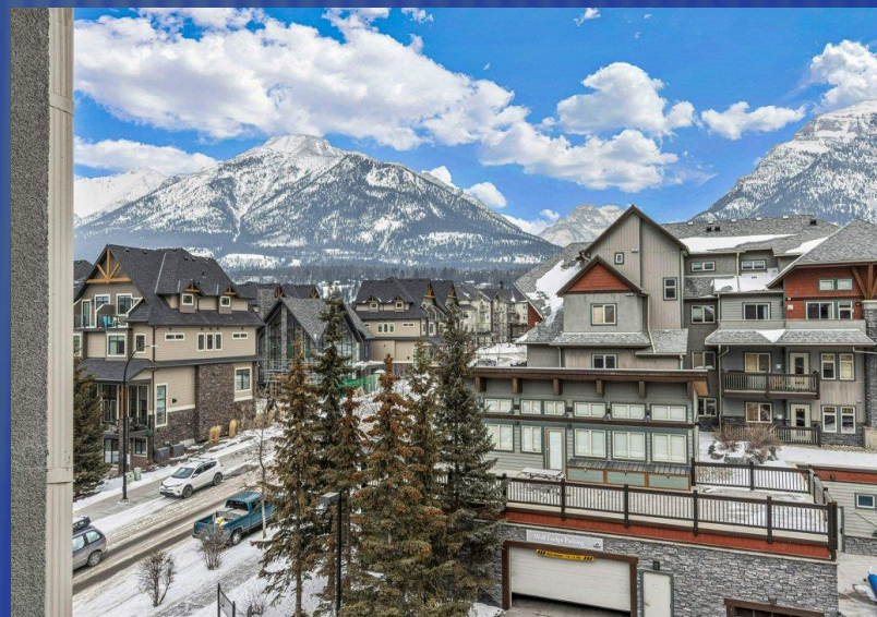
Wake Up To This View!