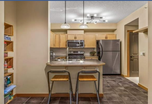
Kitchen With Eating Bar