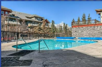
Outdoor Pool Open Yr Round

Property Tax (2022) = $ 5,202.72 Condo Fees (Mthly) = $ 604.24