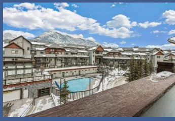
Panoramic Mtn Views From Deck