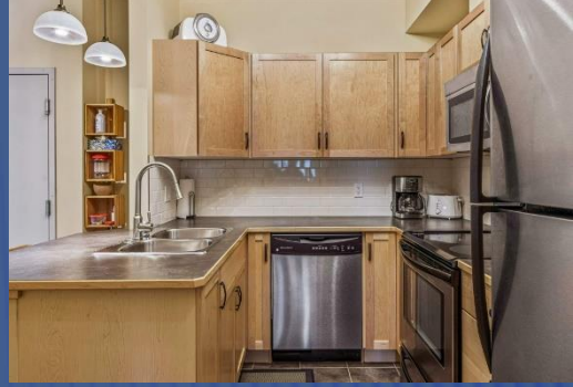
Stainless Steel Appliances

A RARE VALUE! This incredibly well kept, top floor 1BR/1Bth unit features a layout you will love for gatherings and quiet retreats. Panoramic mountain views from every window and a private deck that acts like an outdoor room makes this an ideal mountain home. Located in the Lodges at Canmore, one of Canmore's top managed resorts, you'll love the amenities like an outdoor pool open year round, three hottubs, two open air decks and fitness center. Your unit is easy walking distance to restaurants, shops, trails and the river. When not using it personally you can rent either through Airbnb/VRBO or the onsite managed rental program, and earn very good returns. Layout, location, views, and well managed – this unit checks off ALL the boxes! Take a virtual tour then book your private viewing today