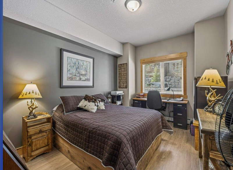
Spacious Master Bedroom