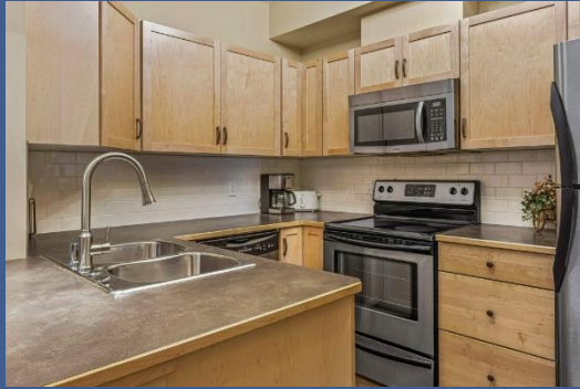
Lots Of Cabinet & Counter Spaces