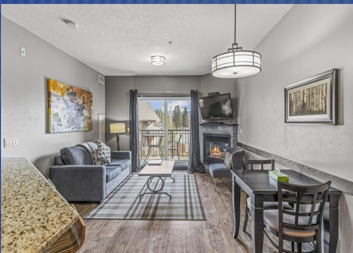
Open Main Living & Dining Area