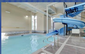
Indoor Pool With Waterslide