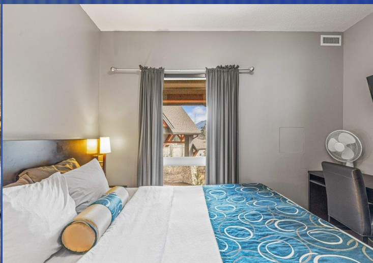
Master Bedroom With Workspace