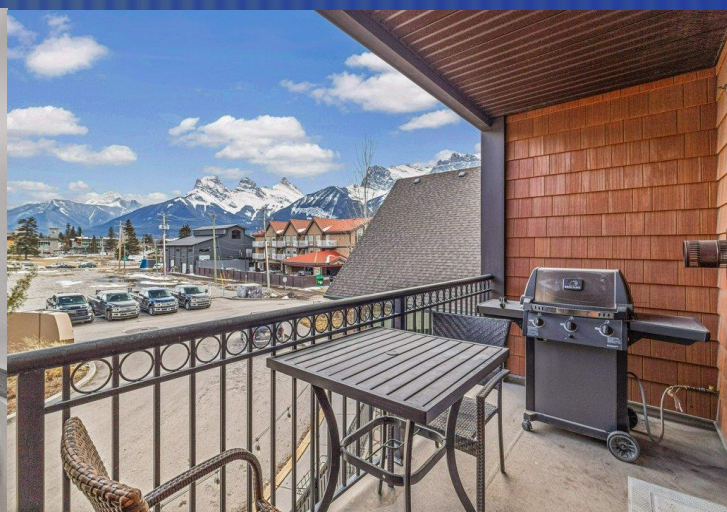
South Facing Deck With Mountain Views