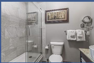
Upgraded 3pc Bath