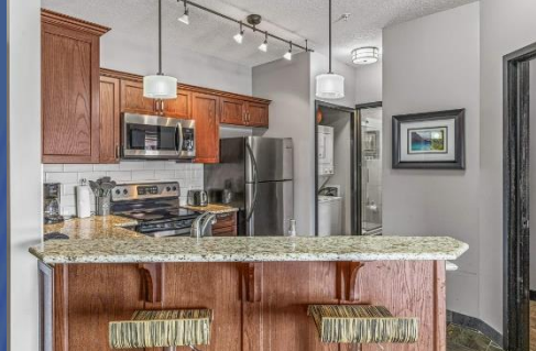
Kitchen With Eating Bar