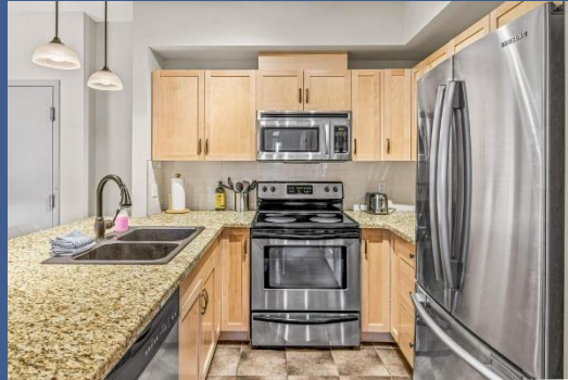
Stainless Steel Appliances