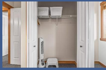
Nice Closet Space Throughout