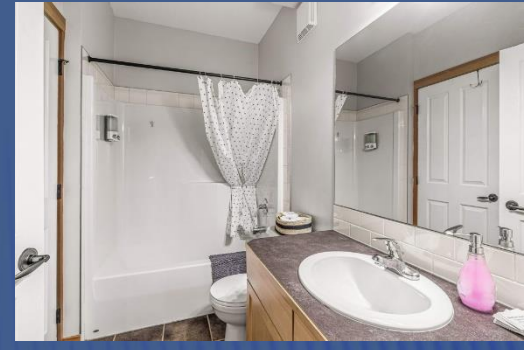
4pc Main Bath

Escape to the serene beauty of the mountains with this stunning, top floor, 2BR/ 2Bth condo. As you step inside, you'll be greeted by an open living and dining area, perfect for relaxing and enjoying the natural scenery that surrounds you. Large windows let in plenty of natural light, highlighting the beautiful mountain views. The modern kitchen features stainless steel appliances, granite countertops, and ample storage space for all of your cooking needs. The Master Bedroom offers an ideal place to retreat and recharge and you'll love the 4pc Ensuite featuring separate shower and soaker tub. The Second Bedroom offers a bunk bed configuration for added flexibility. Step outside onto the spacious private balcony and take in the breathtaking views of the mountains. Perfect for enjoying your morning coffee or evening cocktail, this space is an ideal spot for unwinding and taking in the peaceful surroundings. Located in the Lodges at Canmore, one of Canmore's best run resorts, the condo complex features amenities such as a fitness center, 3 hot tubs, and outdoor pool, allowing you to relax and rejuvenate in style. With easy access to nearby trails, shops and restaurants you are minutes away from all that Canmore has to offer. When not using your mountain getaway you can rent through Airbnb/VRBO, etc through third party rental providers or personally and earn great $$$$. Take a virtual tour then book your private viewing. Your mountain lifestyle begins here with 'Welcome Home'