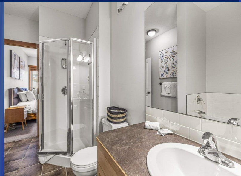
4pc Ensuite With Separate Soaker Tub