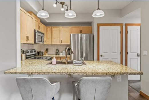
Kitchen With Eating Bar