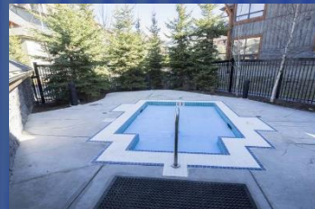
Second of Three Hottubs