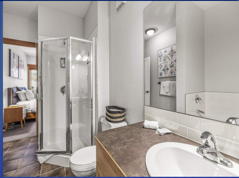
Master Bedroom With Mountain View