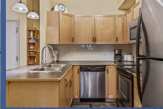
Stainless Steel Appliances

A RARE VALUE! This incredibly well kept, top floor 1BR/1Bth unit features a layout you will love for gatherings and quiet retreats. Panoramic mountain views from every window and a private deck that acts like an outdoor room makes this an ideal mountain home. Located in the Lodges at Canmore, one of Canmore's top managed resorts, you'll love the amenities like an outdoor pool open year round, three hottubs, two open air decks and fitness center. Your unit is easy walking distance to restaurants, shops, trails and the river. When not using it personally you can rent either through Airbnb/VRBO or the onsite managed rental program, and earn very good returns. Layout, location, views, and well managed – this unit checks off ALL the boxes! Take a virtual tour then book your private viewing today