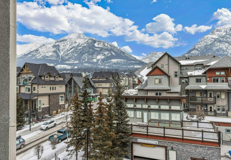
Comfortable Bedroom With Mountain View