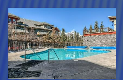
Outdoor Pool Open Yr Round