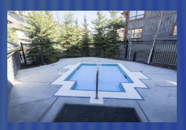
Second of Three Hottub