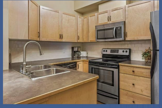
Lots Of Cabinet & Counter Spaces