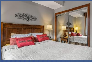
Bedroom With Storage