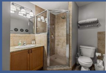
4 pc. Main Bath