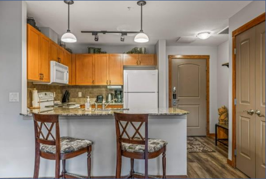
Kitchen With Eating Bar