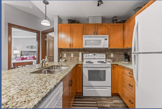
Lots Of Cabinet & Counter Spaces