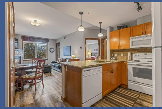
Well-Equipped To Entertain

You'll love this immaculately well kept 1BR/1Bth unit in Falcon Crest Lodge, one of Canmore's highest rated resorts. Enjoy sunsets and nice mountain views from the deck of this pet friendly ground floor unit. Relax in front of the fireplace after a great day outdoors. Prepare gourmet meals in your well- equipped kitchen. Unwind in one of the two hottubs onsite. Use the fitness room for those days you just want to stay in. Ideally located, you are minutes walk from trails, restaurants, shops and all that Canmore has to offer. When not using your unit as your mountain retreat or live/work space, continue to rent it either as a self-managed Airbnb or through the onsite rental management and earn good returns. Location, layout, comfort, views and rental potential, all wrapped together in an affordable option for mountain living. Welcome home! Take a virtual tour then reserve your private viewing.