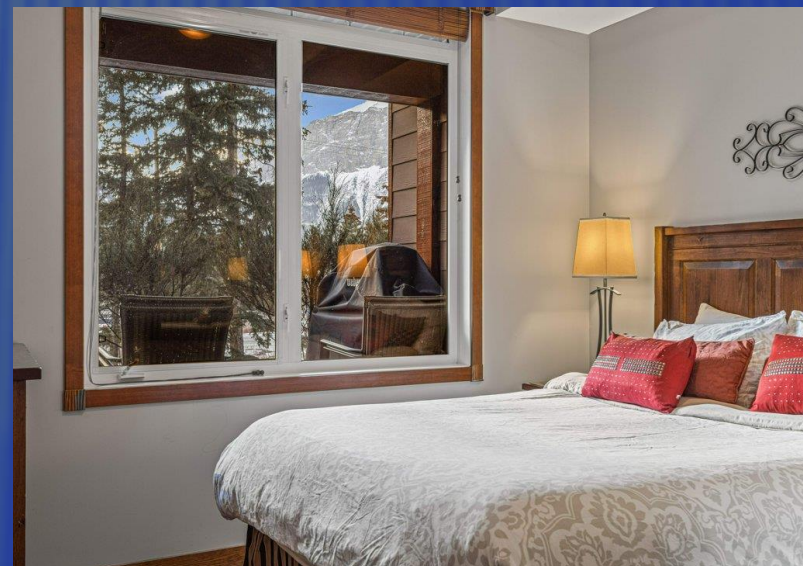
Comfortable Bedroom With Mountain View