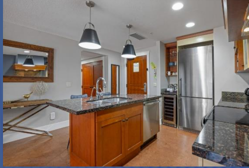
Kitchen With Eating Bar