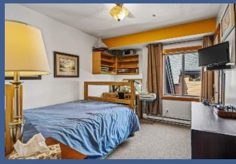
Main Level Bedroom