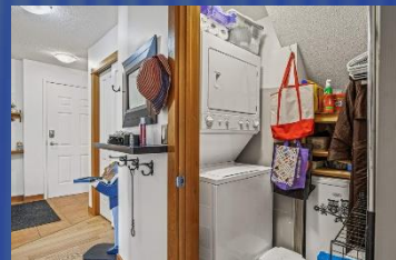
In - Unit Laundry