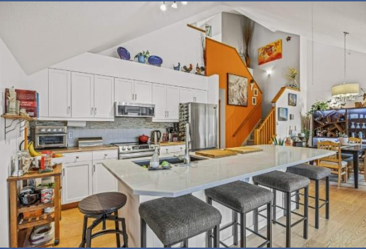
Updated Kitchen With Lots Of Counter & Cabinet Space + Stainless Appliances