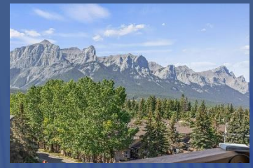
Deck1 Mountain Views