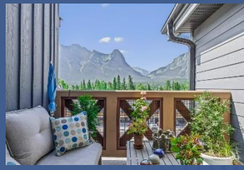
Private Second Deck