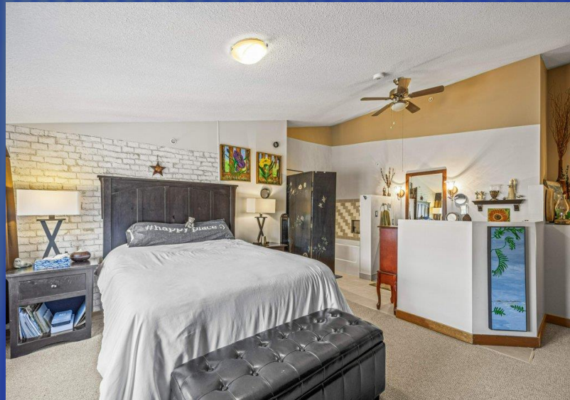
Bright Master Bedroom With 3pc Ensuite