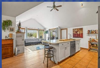
High Ceilings Throughout

Property Tax (2022) = $3,243.94 Condo Fees (mth) = $1,129.36