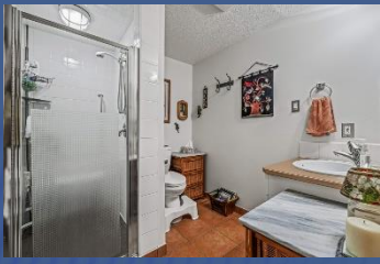
3pc Main Level Bath