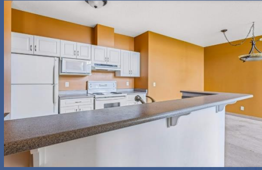
Kitchen With Eating Bar