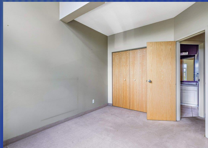
Primary Bedroom With Vaulted Ceiling Let's You Wake Up To Great Mountain Views