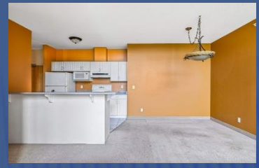
Separate Dining Area