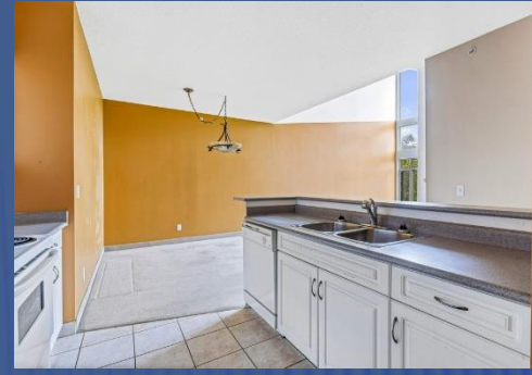
Kitchen + Dining Area

You will love the mountain views from this top floor 2BR/1Bth unit with vaulted ceilings and large windows that let in lots of natural light. Located in Panorama Plaza you are easy walking distance to downtown, shops and trails. The open layout of the main living space makes entertaining a breeze. The bedrooms provide a reflective space to enjoy the play of sunlight across the mountains. This home is zoned for full time living and would be ideal as a mountain getaway, in retirement or as a live/work setup. List priced below market you'll have room to update the unit and put your mountain lifestyle touches into your home while still coming in under budget. Views... location... affordability. Make this home, YOUR home. Take a virtual tour then book your private viewing today.