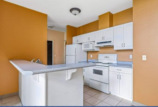
Kitchen –Ample Counter+Cabinet Space