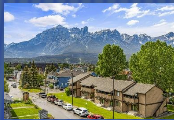
180 Degree Spectacular Mountain Views – Sunrise To Sunset