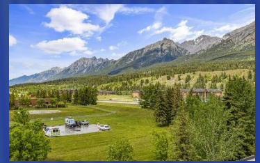
180 Degree Spectacular Mountain Views – Sunrise To Sunset