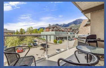
Sunsets Anyone ?