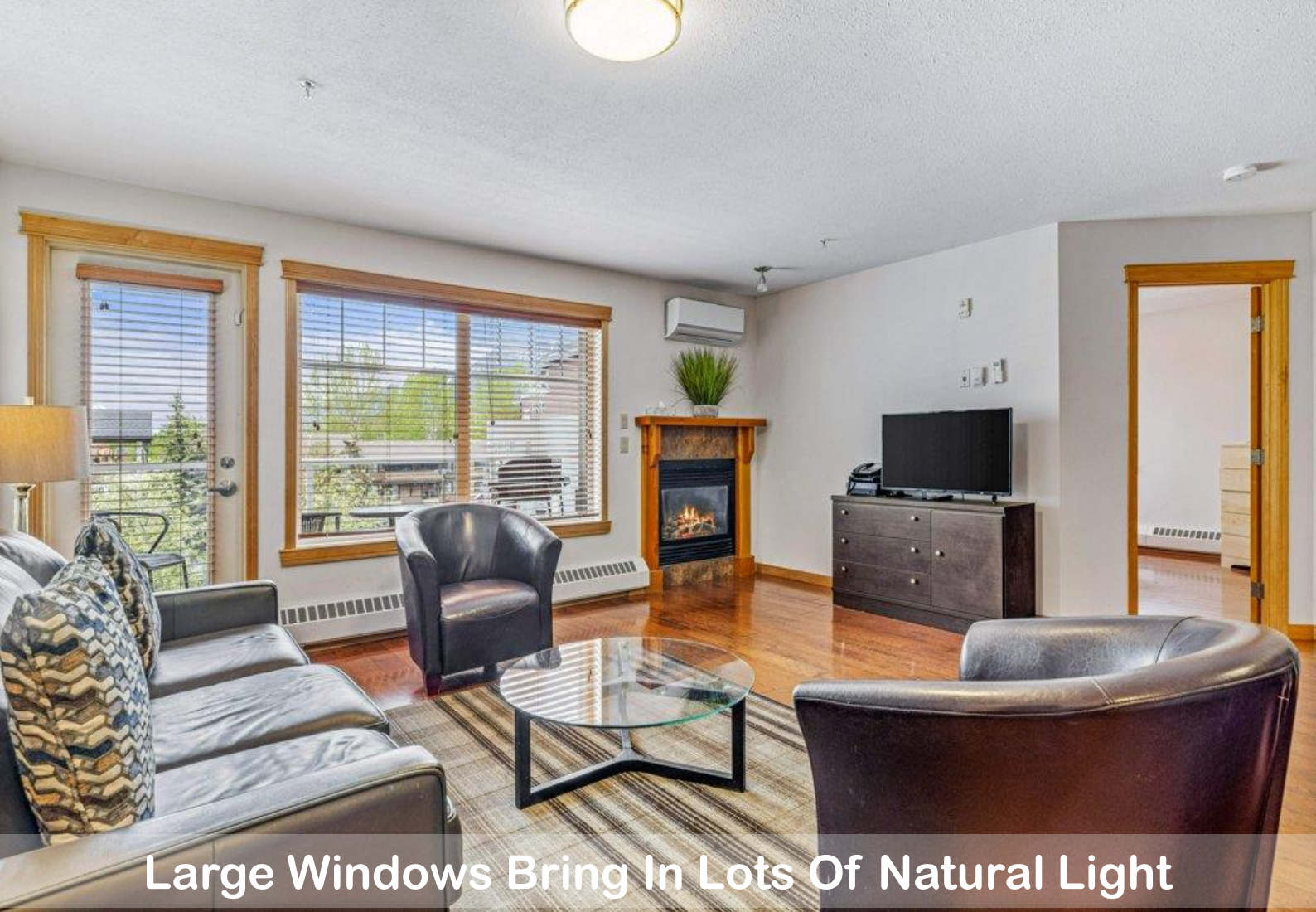
Large Windows Bring In Lots Of Natural Light