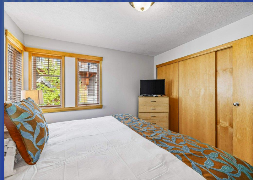
Spacious Bedroom With Large Closet Space