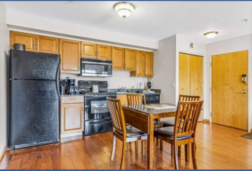
Well Laid Out Kitchen