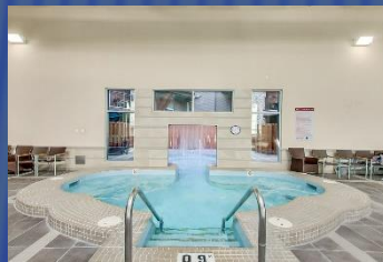
Grand Rockies Hottub