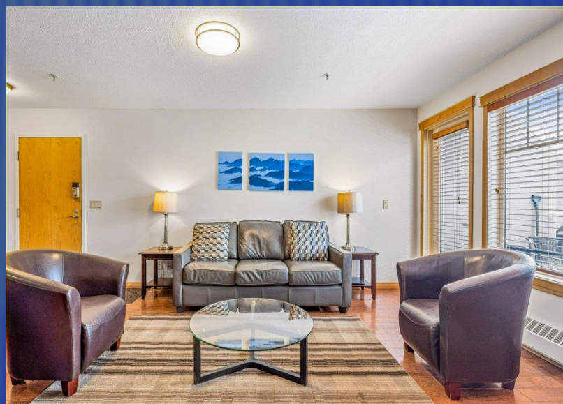
Spacious Open Main Living Area