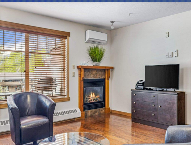
Relax By The Fireplace & Unwind