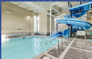
Grand Rockies Indoor Pool

Property Tax (2022) = $3,717.80 Condo Fees (mth) = $ 497.41