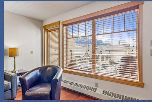
Mountain Views From Every Window

You'll love the large windows in this corner unit that let in lots of natural light as well as great mountain views. Ideally located on Bow Valley Trail you are only minutes walk from restaurants, shopping, trails and all that Canmore has to offer. This 1BR/1Bth unit offers 590 sqft of well laid out living space along with a partially covered deck you'll enjoy watching the sun setting behind the mountains on. The zoning for this unit is Tourist Home allowing you the flexibility of primary residence, long or short term rentals making it a great live/work space or mountain getaway. When not using personally continue to rent it in the managed rental program provided by Sunset Resorts or self manage to earn good returns. Take a virtual tour , then book your private viewing of this affordable entry into the Canmore market. Welcome Home!