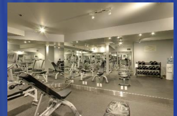
Grand Rockies Fitness Rm