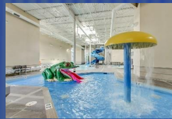
Grand Rockies Kiddie Pool