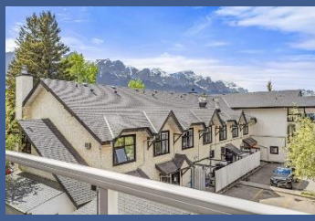
Deck View – Rundle Range