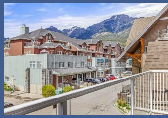
Deck View – Fairholme Range