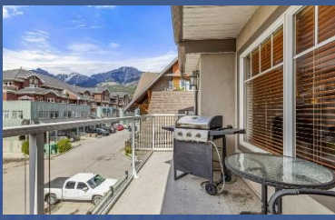
Partially Covered Deck