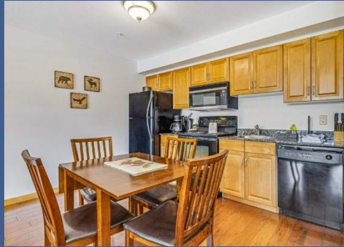
Kitchen With Dining