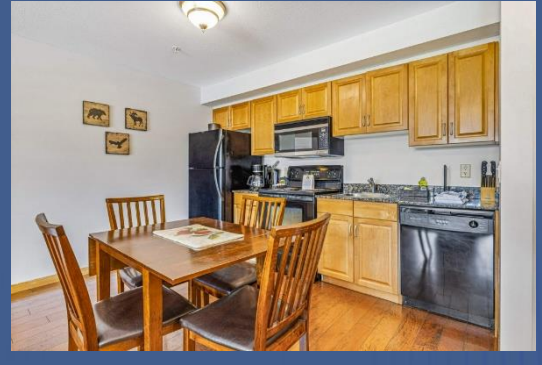
Kitchen With Dining