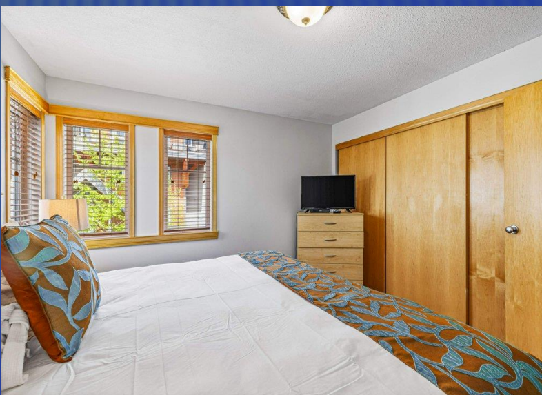
Spacious Bedroom With Large Closet Space