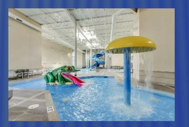
Grand Rockies Kiddie Pool