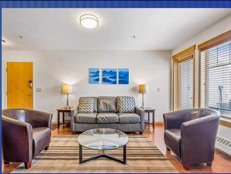
Spacious Open Main Living Area