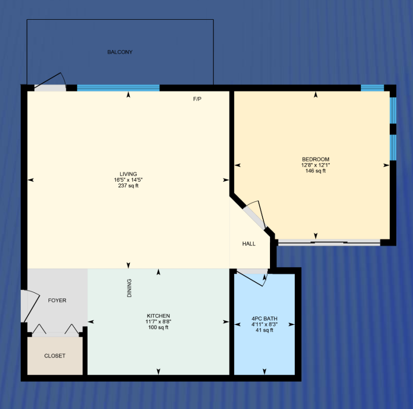
TOTAL FIN. SQFT = 590 TOTAL INT. ABOVE GRADE SQFT= 590