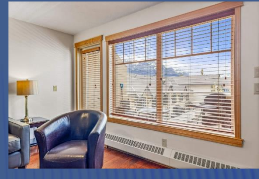
Mountain Views From Every Window

You'll love the large windows in this corner unit that let in lots of natural light as well as great mountain views. Ideally located on Bow Valley Trail you are only minutes walk from restaurants, shopping, trails and all that Canmore has to offer. This 1BR/1Bth unit offers 590 sqft of well laid out living space along with a partially covered deck you'll enjoy watching the sun setting behind the mountains on. The zoning for this unit is Tourist Home allowing you the flexibility of primary residence, long or short term rentals making it a great live/work space or mountain getaway. When not using personally continue to rent it in the managed rental program provided by Sunset Resorts or self manage to earn good returns. Take a virtual tour, then book your private viewing of this affordable entry into the Canmore market. Welcome Home!