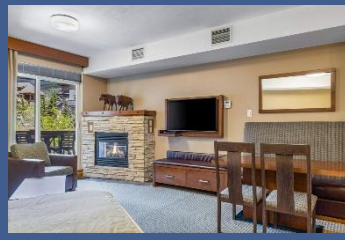
Living + Dining Area