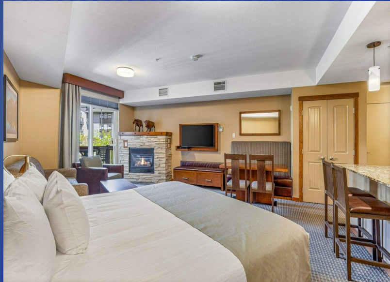
Spacious Open Main Living Area