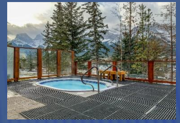
Three Sisters Hottub