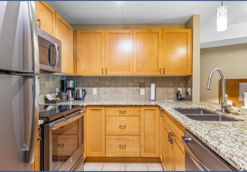
Well Equipped Kitchen