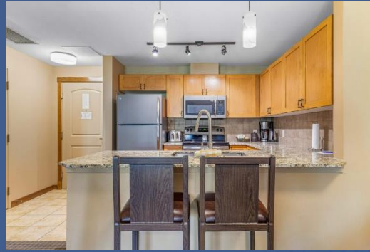
Kitchen With Eating Bar