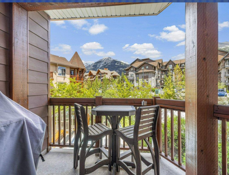
Enjoy Mountain Views From Deck & Livingroom