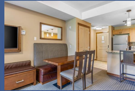
Separate Dining Area

Falcon Crest Lodge is easy walking distance to trails, shops, downtown and all Canmore has to offer. You'll love the functionality of this studio unit that can sleep four. Relax in front of the fireplace after a day outdoors. Explore culinary experiences in your well equipped kitchen. Recharge in a choice of hottubs. Enjoy the sun setting on the mountains from your covered deck. Refresh in your mountain getaway. When not using your unit personally you can continue to rent in the managed rental program which has been given the Traveler's Choice Award for 2022 and ranked as #1 out of 30 resorts in Canmore or pursue self-managed options. Relax..Recharge..Refresh.. at an affordable price point that will pay you dividends in memories, and as an investment for years to come. Take a virtual tour then book your private viewing and step into your piece of the mountain lifestyle.