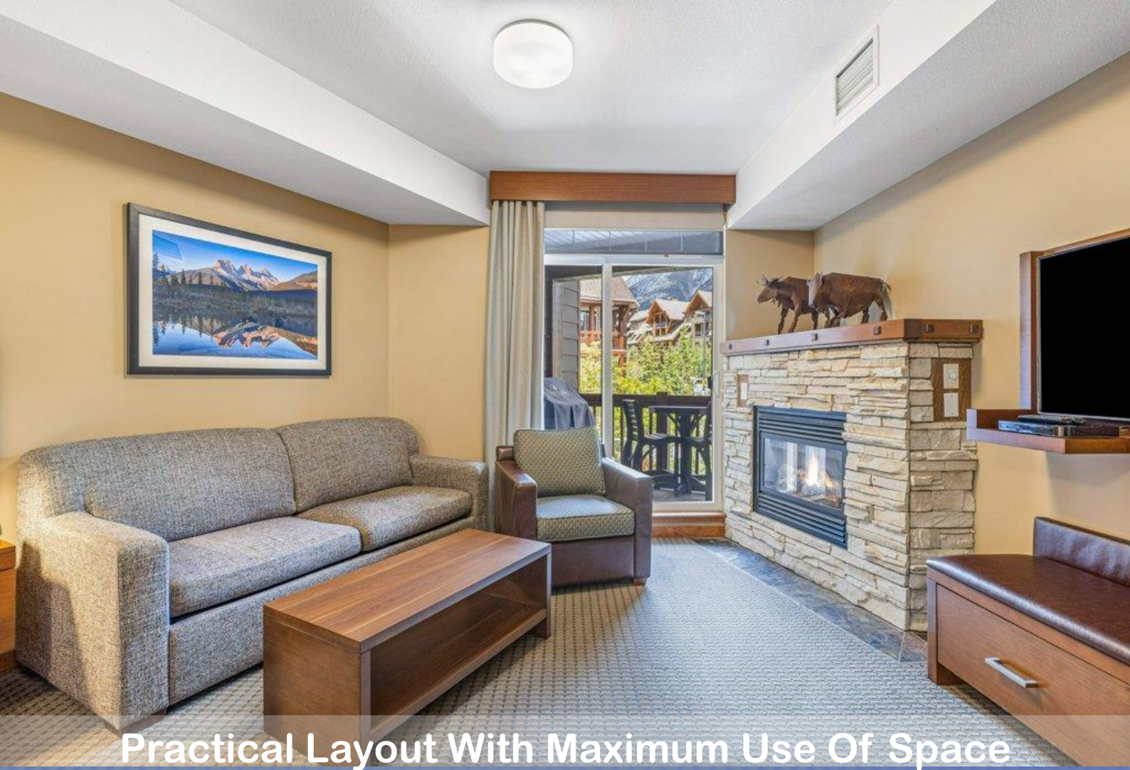
Practical Layout With Maximum Use Of Space