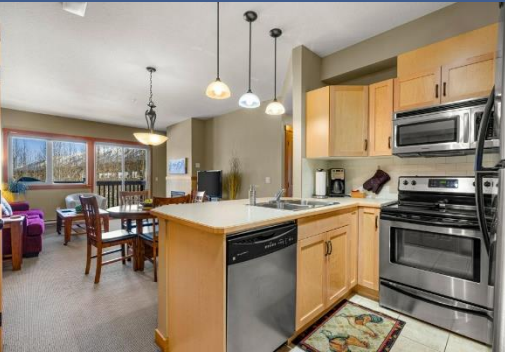
Kitchen- Well Equipped For Gourmets