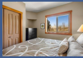
Second Bedroom View