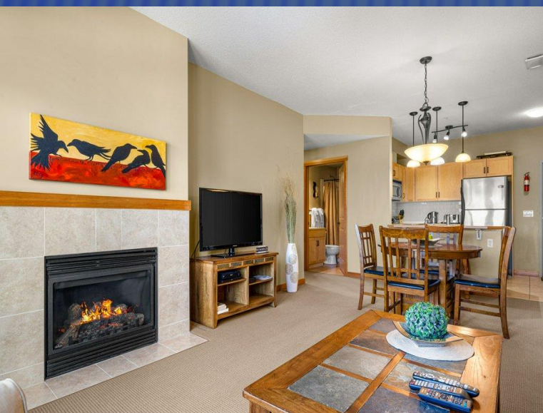
Relax By The Fireplace & Unwind