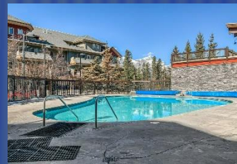
Heated Outdoor Pool