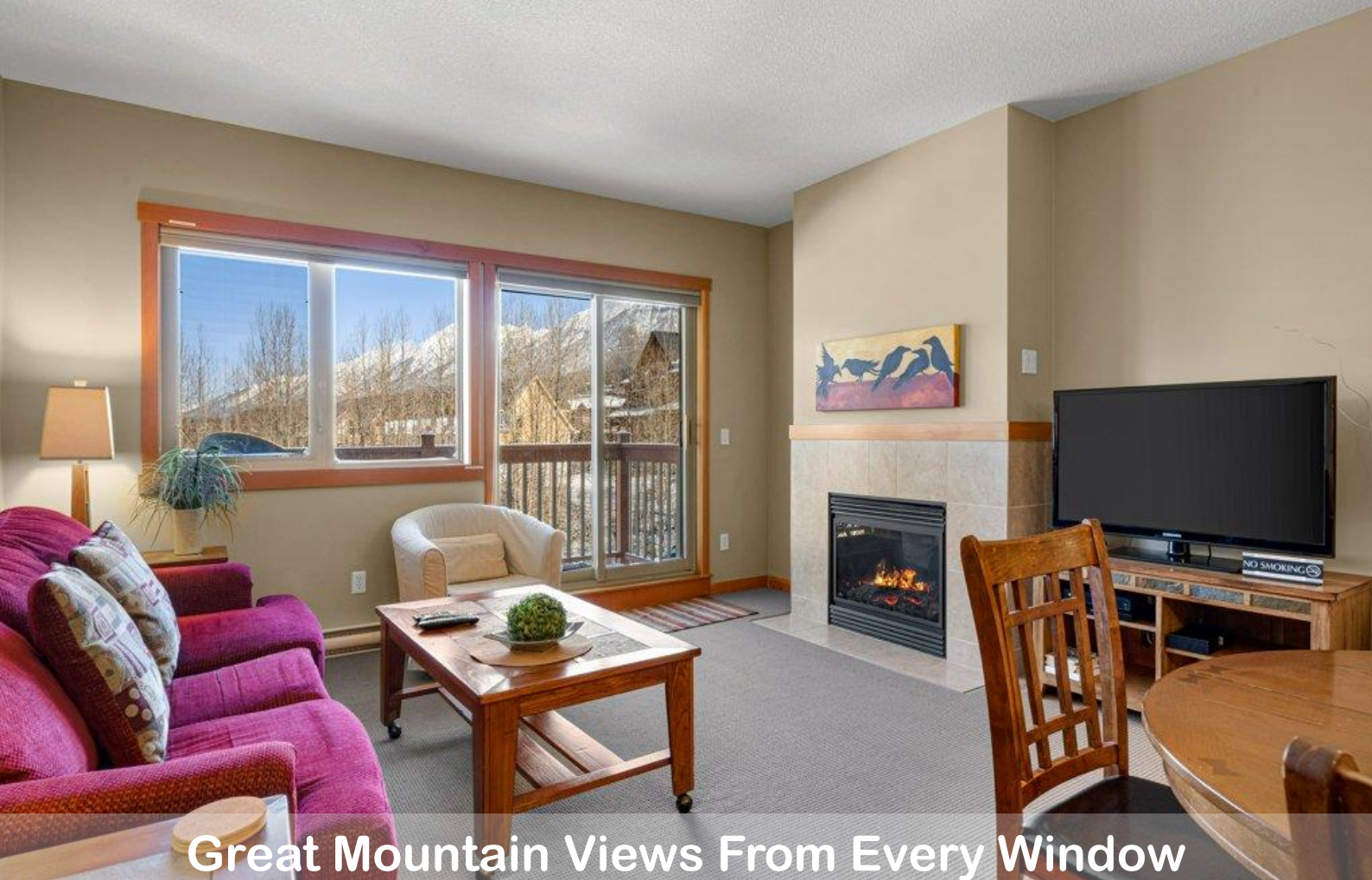
Great Mountain Views From Every Window