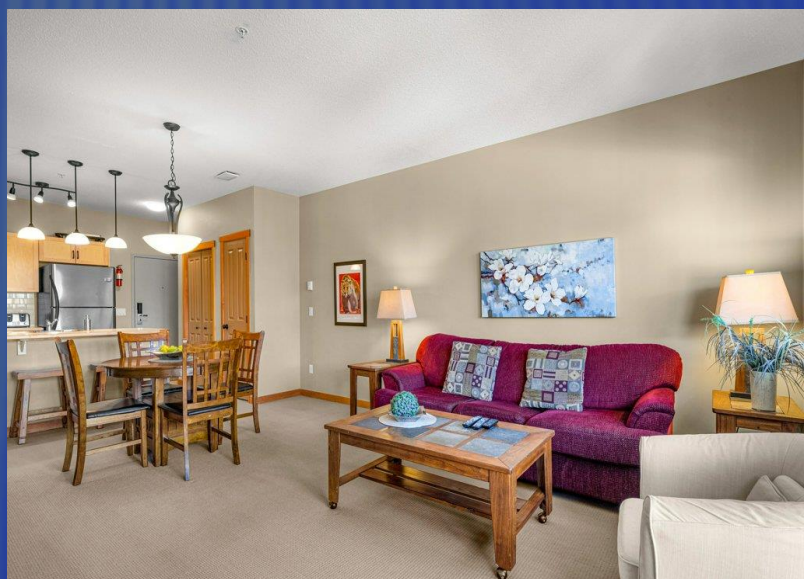
Spacious Open Main Living Area