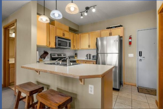
Kitchen With Eating Bar