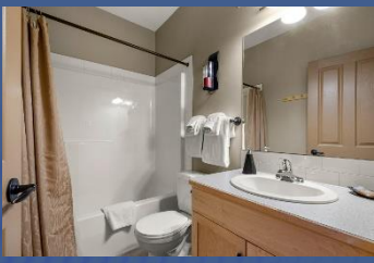
4pc Ensuite Bath