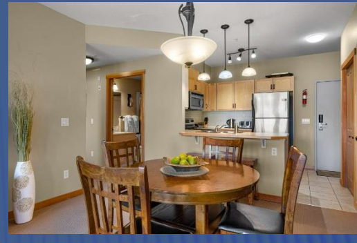
Separate Dining Area

You will love how this turnkey 2BR/2Bth unit combines privacy with open layout. Add in mountain views from every window; locate it in one of the best resorts in Canmore offering a heated pool, three hot tubs, fitness center, open air decks with great views and top it all off with easy walking distance to downtown, the river, trails, shops and restaurants. Put it all together and you have the perfect mountain retreat for personal use and a highly rated choice for Airbnb earning good revenues. Take a virtual tour then book your private viewing. This one will be on your short list!