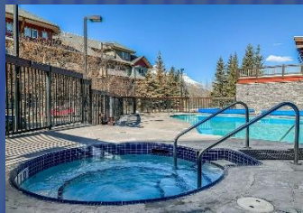
One Of Three Hottubs