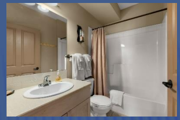
4pc Main Bath