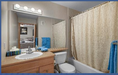
4pc Master Ensuite