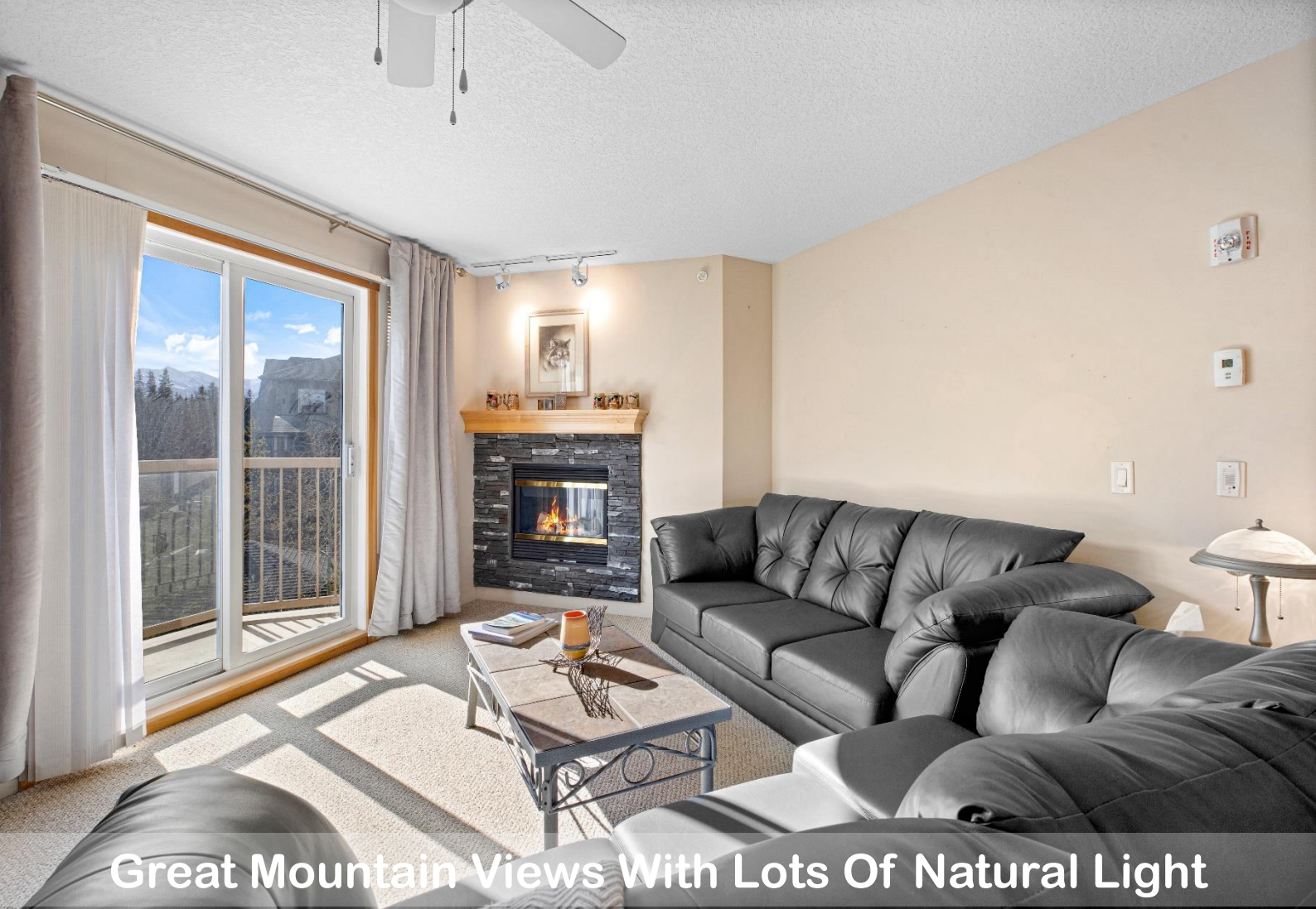
Great Mountain Views With Lots Of Natural Light