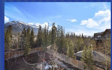
Enjoy Spectacular Sunrises