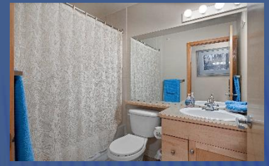
4pc Main Bath