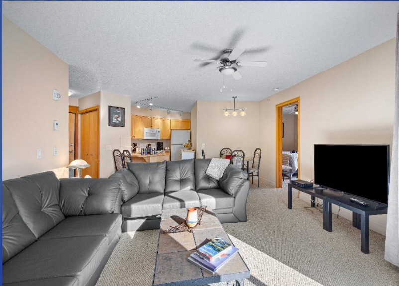
Spacious Open Main Living Area