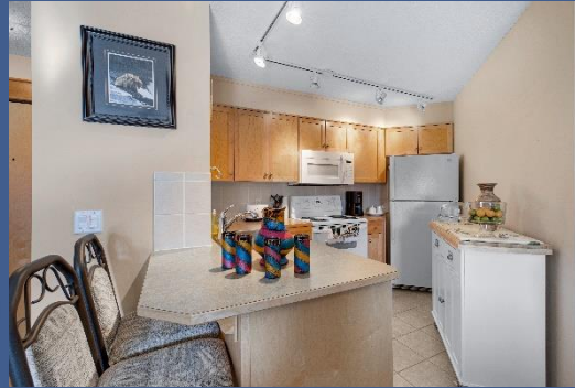
Kitchen With Eating Bar