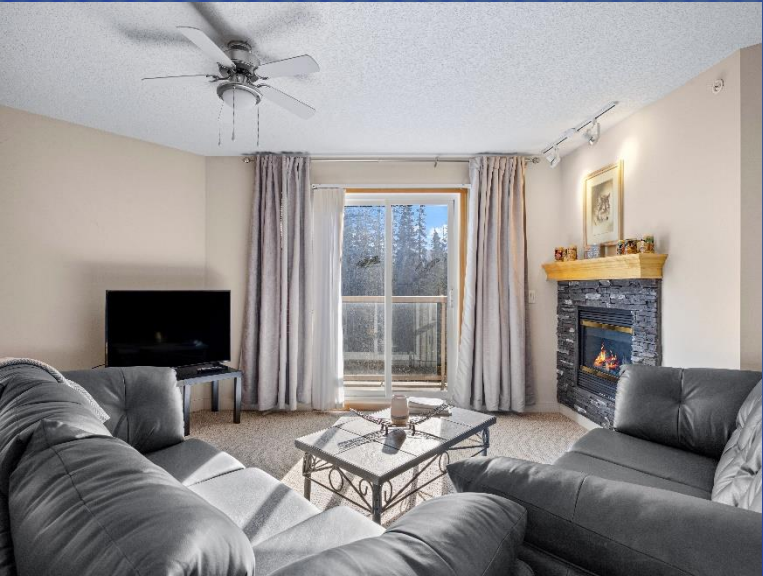
Relax By The Fireplace & Unwind