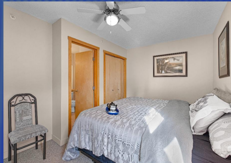
Primary Bedroom – Wake To Mountain Views