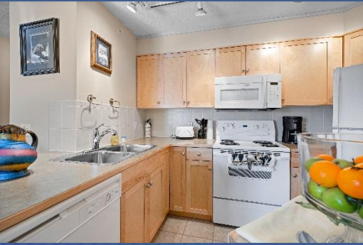
Well Equipped Kitchen