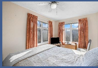
Second Bedroom With View