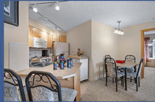
Separate Dining Area

You will love the privacy and views from this well laid out top floor unit. Spacious bedrooms on either side of an open concept main living area offers a nice combination of gathering and private retreat spaces. This very lightly occupied home was used as a private retreat but comes fully furnished and equipped making it Airbnb ready. Located in Windtower Lodge you are easy walking distance to trails, downtown and the river. Onsite amenities include hottub and fitness room and an onsite café opening soon. The Tourist Home zoning allows you to live full-time making it a great retirement or live/work option but the zoning also allows you to rent short term giving you ideal flexibility for changing needs. Take a virtual tour then book your private. Units in this resort do not last long so don't delay!!