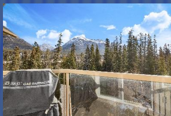
Deck - Private Setting