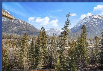
Mountain Views From Deck