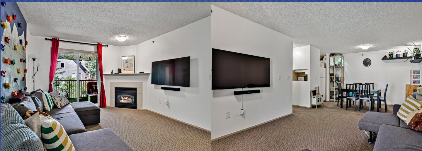
Relax By The Fire After Day Outdoors