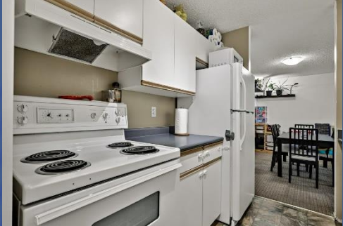
Kitchen Has Nice Amount Of Cabinet + Counter Space