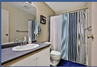
4pc. Main Bathroom