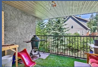
Covered Deck – Like Having An Extra Room Outdoors