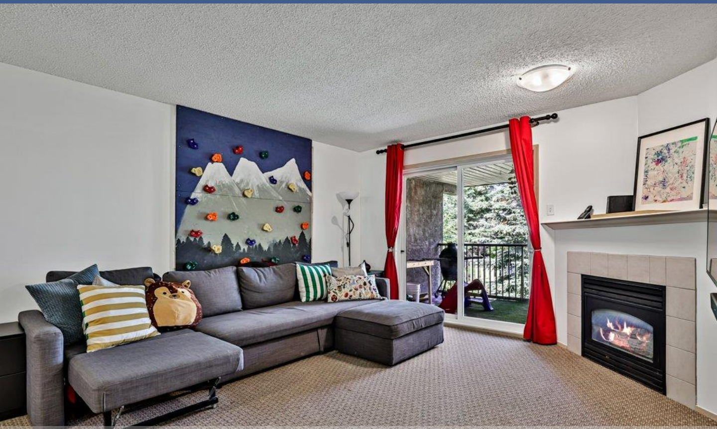
Spacious Main Living Area Opens Onto Private Covered Deck