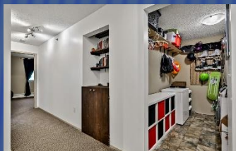
Storage Well Laid Out