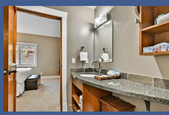
4pc Main Bath