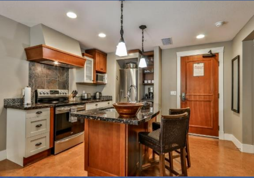
Spacious Kitchen– Fully Equipped For Your Needs Including Bar Fridge