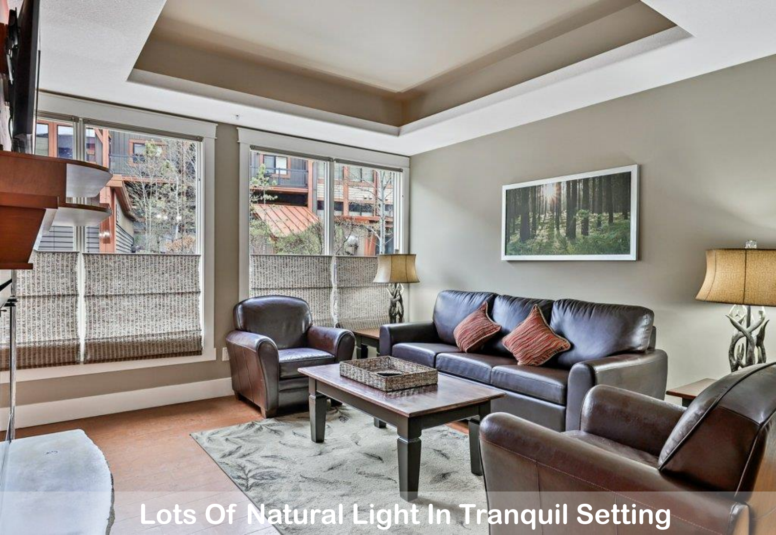
Lots Of Natural Light In Tranquil Setting