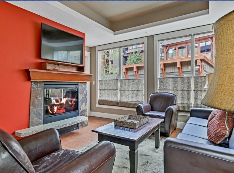
Relax By the Fireplace After A Great Day Outdoors