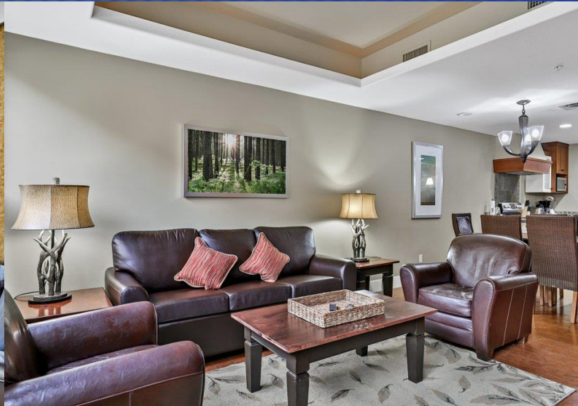
Open Concept Main Living Area