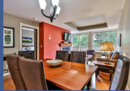
Dining Area – Great For Entertaining

You'll love the garden like setting of this fully furnished and equipped 2 Bedroom, 2 Bath unit in highly sought after Solara Resort. Peaceful...tranquil; an ideal setting to relax and recharge. Its spacious 926 sqft layout provides a nice balance of open concept main living area combined with private spaces to retreat to. Located close to trails, minutes walk to downtown and shops/restaurants you are never far from all that Canmore has to offer. When not using your unit personally as your mountain getaway or work from home destination you can rent it either through the onsite managed rental or through Airbnb, etc. and earn good returns. Take a virtual tour and then book your private viewing. In today's market this unit checks the boxes! Your mountain retreat awaits.