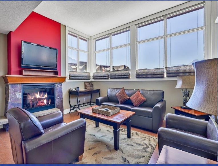
Relax After A Great Day Spent Outdoors