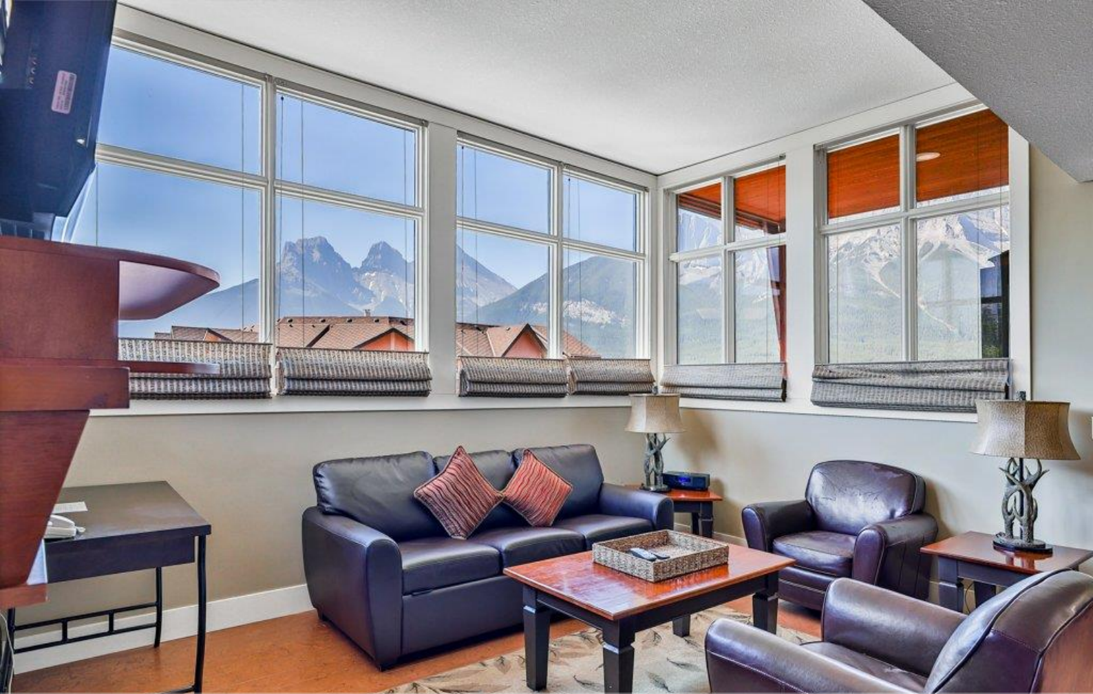
Panoramic Mountain Views With Lots Of Natural Light