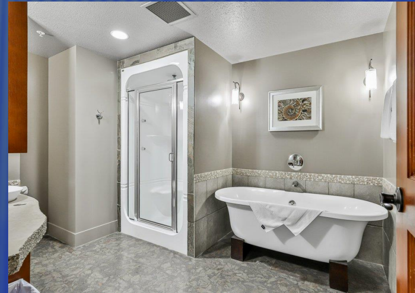
Full 4pc. Primary Ensuite