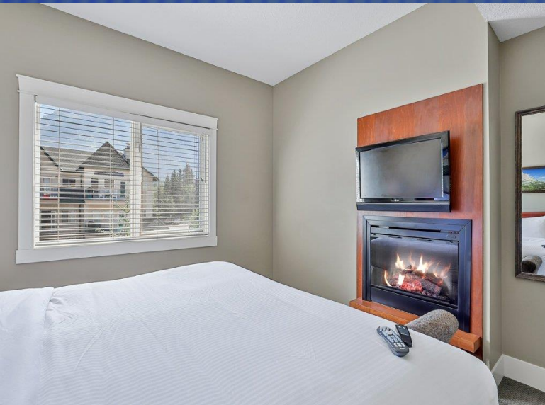
Primary Bedroom Suite – Wake To Mtn Views