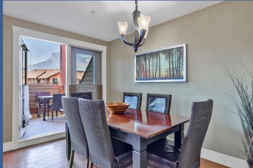
Separate Dining Area