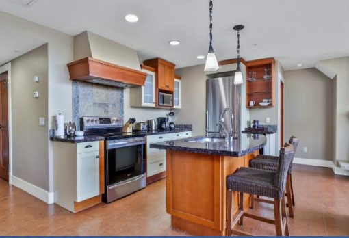
Spacious Kitchen– Fully Equipped