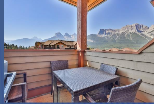
Views From Private Deck

From the moment you walk into this unit we think you will agree it is an ideal combination of layout and size coupled phenomenal mountain views. Great separation of space allows for gathering places but also private retreats without having to compromise on comfort. An open concept main living area with wrap around windows lets in lots of natural light and mountain vistas. The Primary Bedroom is a suite complete with walk-in closet and 4pc Ensuite Bath. Both bedrooms are spacious and inviting. Take in peaceful sunrises on the deck with your morning coffee and enjoy sunsets reflecting off the Three Sisters. Located in Solara resort, one of Canmore's finest destinations, you'll enjoy the indoor pool and hottub area, the well equipped fitness center and being able to pamper yourself with a day at the spa. A short walk and you are on the trails, exploring restaurants, shops and all that Canmore has to offer. When not enjoying your mountain retreat personally, rent your unit either through the onsite managed program or self-manage through Airbnb,etc. and earn good returns. Looking for the mountain lifestyle you have dreamed about... it awaits you here! Take a virtual tour then book your private viewing today.