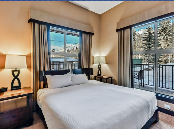
Bedroom With Great Mountain Views