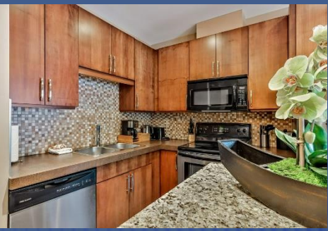
Lots Of Cabinet & Counter Space

All the benefits of owning a fully furnished and equipped mountain retreat in Canmore can be yours in this affordable quarter share giving you 12 weeks per year usage. You'll love the cozy 581 sqft 1BR layout. Enjoy 3+season usage of the huge, covered, wrap-around deck offering nice mountain views. Known as 'Mountain Zen' touches like the granite countertops, bamboo and slate flooring with in-floor heating, spacious spa-like soaker tub all help stresses of daily life to melt away from the moment you arrive. Enjoy on site amenities such as the spa, steam room, fitness area and restaurant. Located within easy walking distance of restaurants, shops, and trails you are minutes away from all Canmore has to offer. The unit comes with privacy drawer in the kitchen for personal items and onsite storage is available in the parkade. This unit is designated pet-friendly allowing for more flexibility than most other fractionals. Take a virtual tour then book your private viewing today.