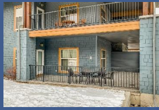
Wrap Around Deck