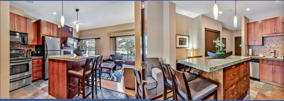
Well Laid Out Kitchen With Eating Bar