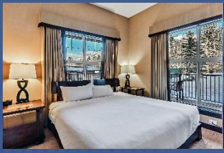
Wake Up To Mtn Views