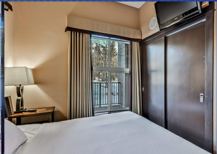
A Relaxing Retreat