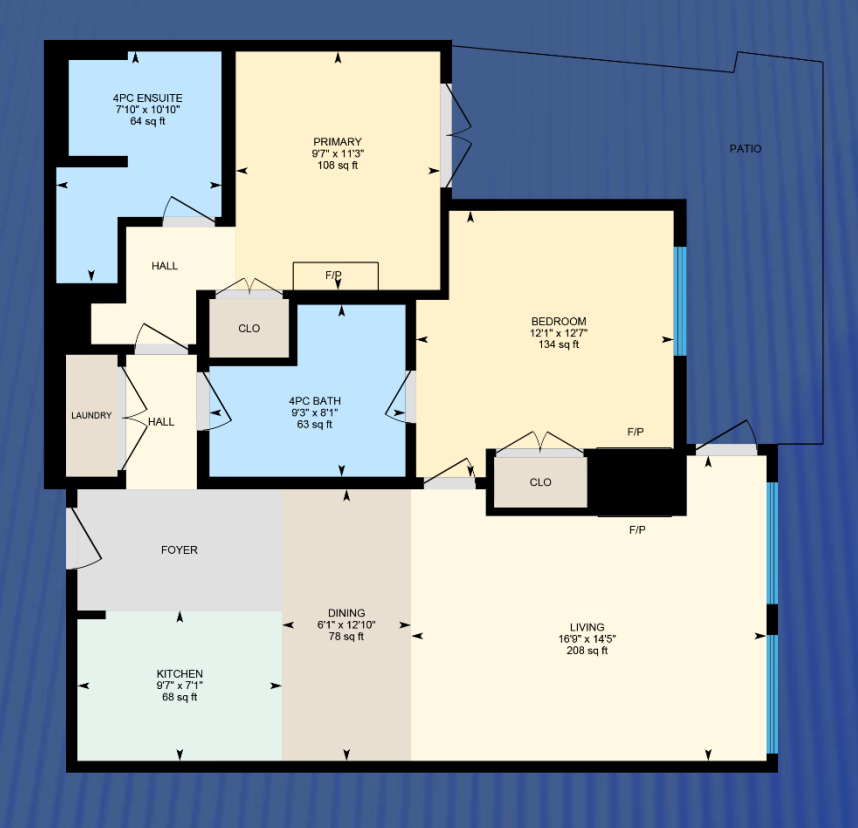
0 3 6 ft